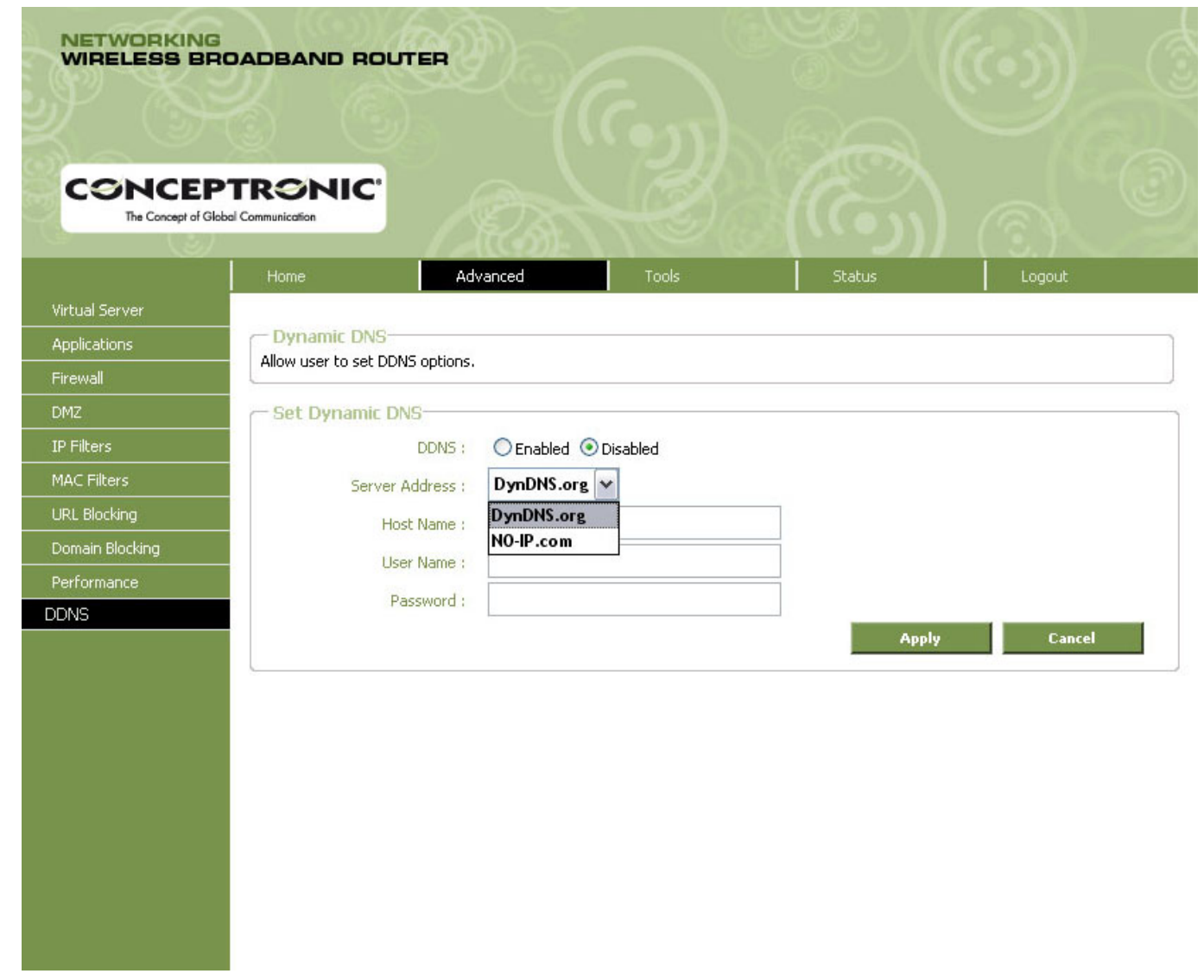
Ac3 Filter Mac Divx Download